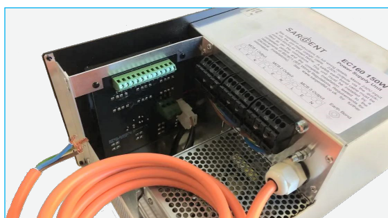
Fitted with pre-wired 2 metre inlet cable