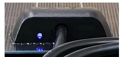
Junction Box with LED