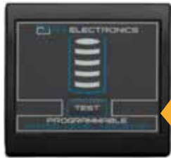
LED INDICATOR Size : 65 x 65 x 16 mm

Programmable LED/LCD water tank indicator. Comes preprogrammed to suit standard sender and 180/200 mm deep tanks. LED is battery operated. LCD is 12V operated.