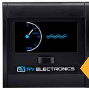
LCD INDICATOR Size : 115 x 108 x 20 mm